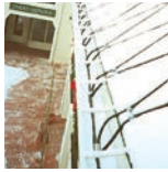
Snow Melting and De-Icing