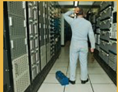
Server and communications facility