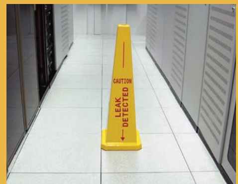
Raised floor computer facility