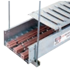
Fire and Performance Wiring